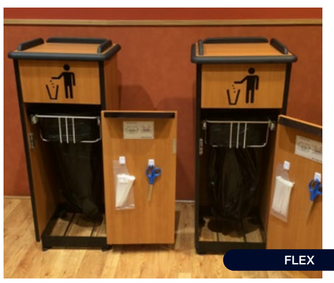
The Longopac system is available in a variety of designs to suit different purposes. There are ready-made solutions with stands to be used in kitchens for instance, cabinets with cassette holders and waste bins. The Longopac system is flexible and can be built into existing cabinets and behind sorting walls. Paxxo also offers metal detectable solutions for environments that require it.